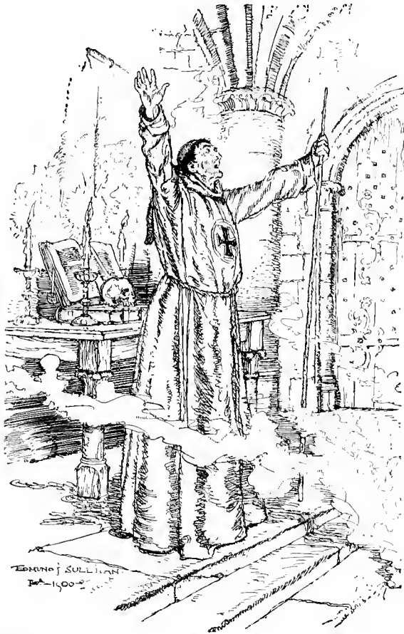
THE FIGURE OF A TALL MAN.